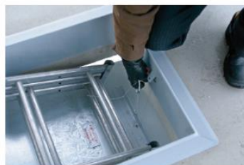
Inside of the hatch