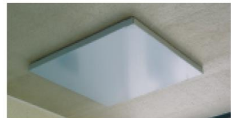
Bottom cover on balcony ceiling