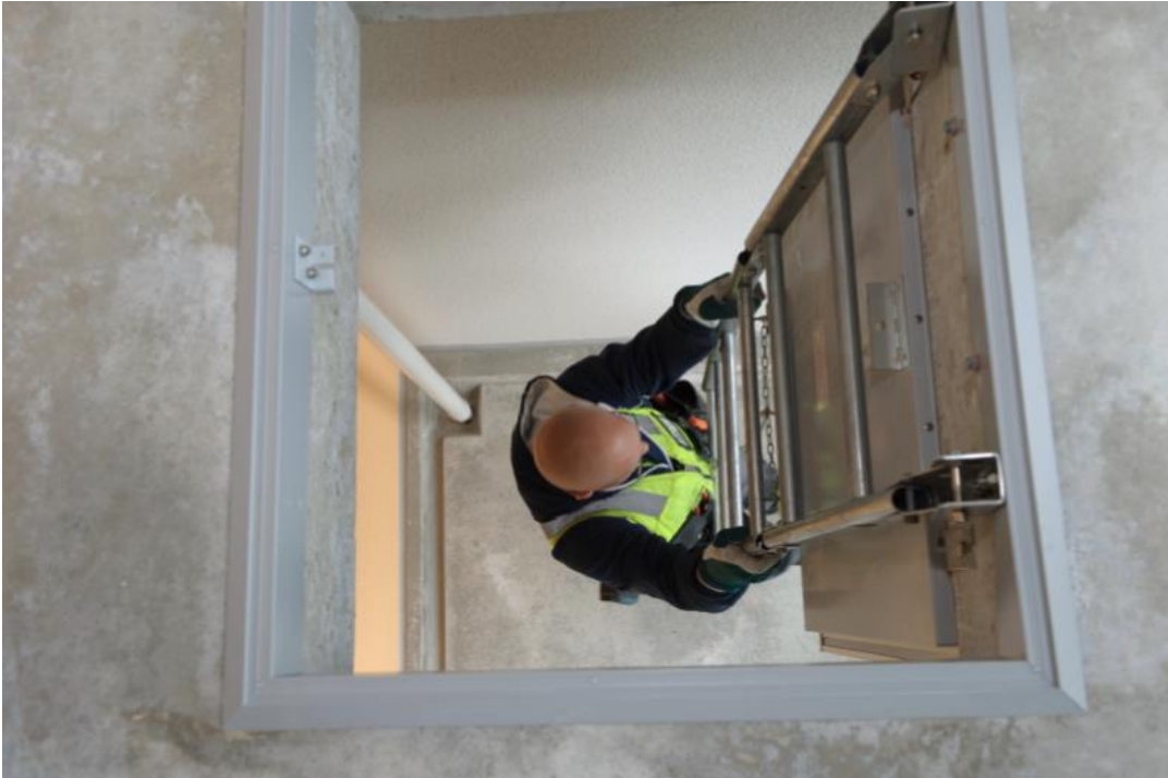
Hatch when opened.