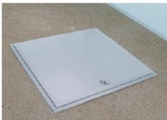
Hatch on the balcony floor