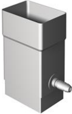
1. K7 x 10 water collector