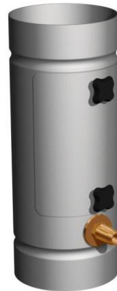
2. P10 water collector