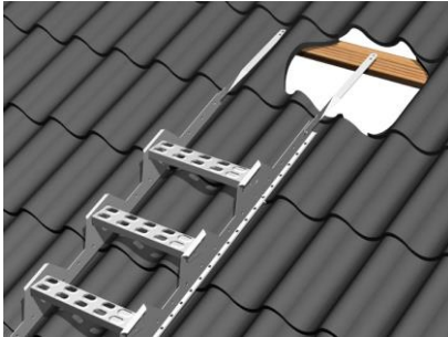
1. Metal sheeting or bitumen roof roof