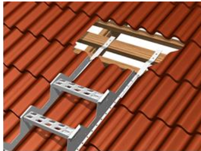
2. Tile roof