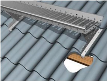
1. Metal sheeting or bitumen roof