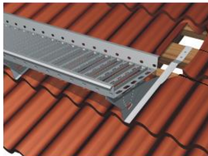
2. Tile roof